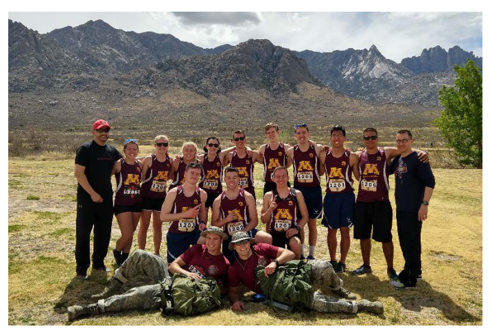
Cadets and Cadre from Detachment 415 at the 29th Bataan Memorial Death March

Teams and individuals participate in the Bataan Memorial Death March for many reasons: personal challenge, the spirit of competition, or to foster esprit de corps in their unit. Some march in honor of a family member or a particular veteran who was in the Bataan Death March during WWII or who was taken as a prisoner of war by the Japanese in the Philippines. Many of these veterans were from New Mexico and the Minnesota National Guard Brainerd's based 34<sup>th</sup> Tank Company.